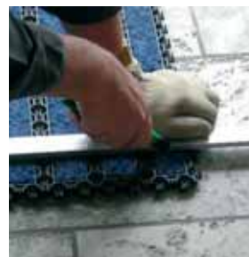
Easy to cut with ruler and knife