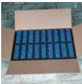
Forma™ pre-assembled in 6 tile units