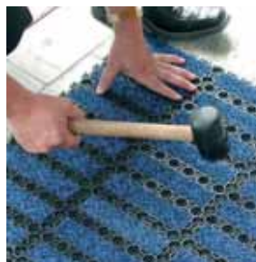
Quick to assemble with a hammer